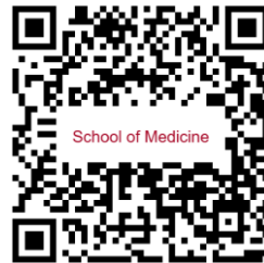
School of Medicine

No. 138, Sheng Li Road, Tainan City 704, Taiwan ( Google Pin )