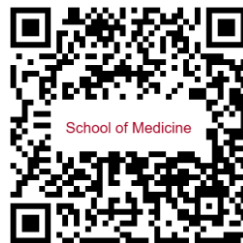
School of Medicine

No. 138, Sheng Li Road, Tainan City 704, Taiwan ( Google Pin )