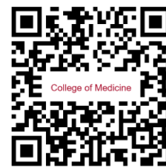
College of Medicine